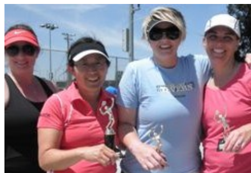
Davis USTA NTRP Tournament 4.0 Doubles Finalists

DTC will again be the home for TEAM Davis, our Special Olympics program. We will start up in the spring. Thank you again for all your support.