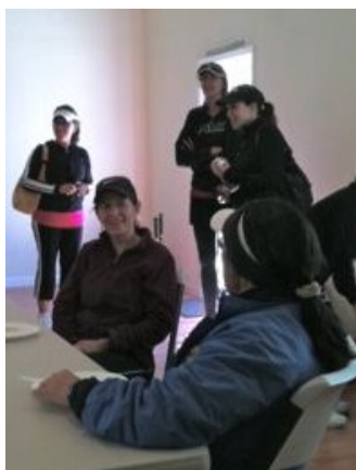
Players enjoying the comfort of the clubhouse after a match.