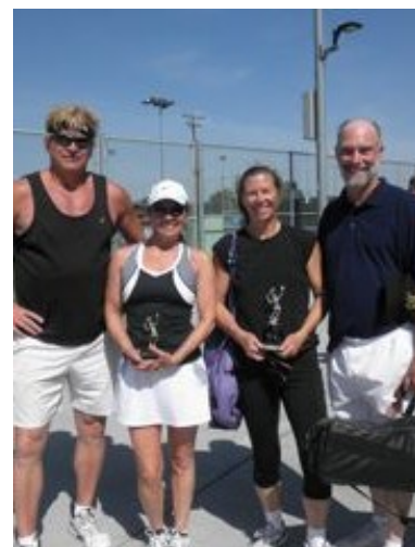
Davis USTA NTRP Tournament Mixed 3.0 Doubles Finalists

Our DTC City Liaison is hard at work following up on issues concerning defective court lights and court washing at the community courts, and court conditions at Walnut Park.