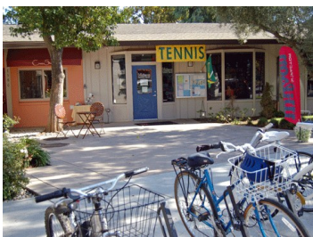
New owners for Volleys, our favorite tennis shop