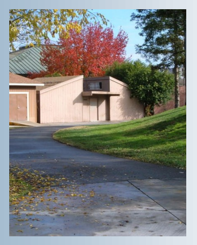
Future home of the Davis Tennis Club Clubhouse (click on image for larger photo).