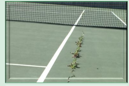
GRASS AND HARD COURTS ARE COMBINED FOR DTC MEMBERS

Where do you stand? Donations to the Fix-It fund can be made using this link: Donate to Davis Tennis Club's Court Fixit Fund