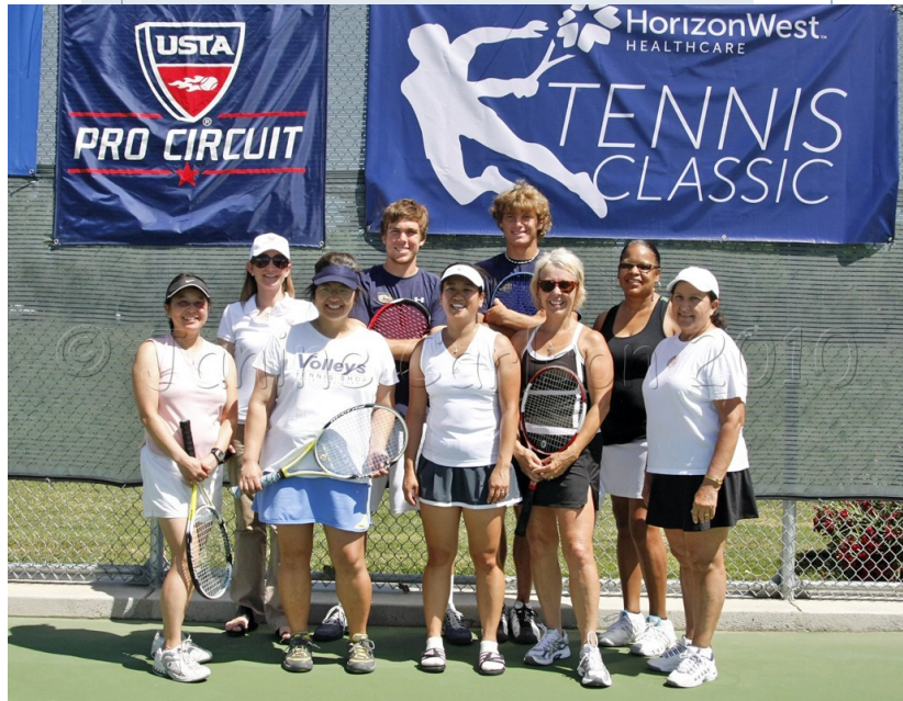
Participants in the Pro-Am event at the USTA Pro Circuit Tournament held at UC Davis this summer.

Check our website for more photos of the USTA Pro Circuit Tournament (including Jack Sock and Bradley Klahn who are playing in the 2010 US Open) !